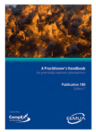
EEMUA Publication 186: A Practitioner's Handbook for potentially explosive atmospheres.